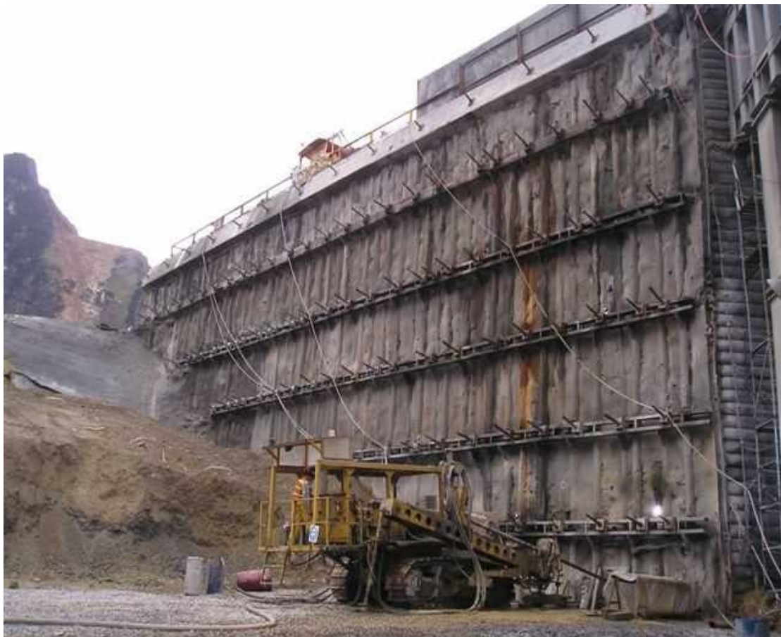
Photo 1 Freeport Mine Anchored piled wall to Crusher 6 Dump Slab