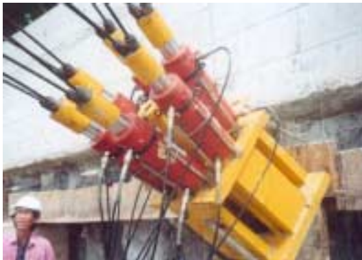
SBMA testing in Singapore

Confidence was boosted by testing each anchor to 150% of its working load of 130t.