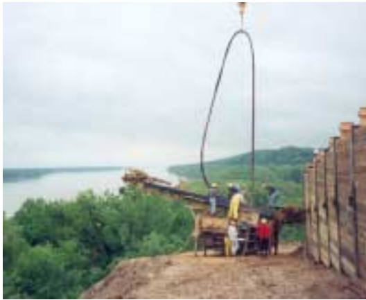
SBMA installation in Natchez, Mississippi, USA.

Anchor design codes allow engineers to assume load is distributed uniformly through the length of an anchor, but experts acknowledge that the ultimate load is not proportional to the anchor's fixed length. As far back as the 1970s world expert Professor Helmut Ostermayer stated: "The increase in carrying capacity of an anchor tapers off steadily with length," adding that lengths of 6m to 7m were optimal.