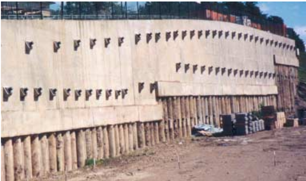
Permanent SBMAs with 1000 kN working load in Newcastle, UK.