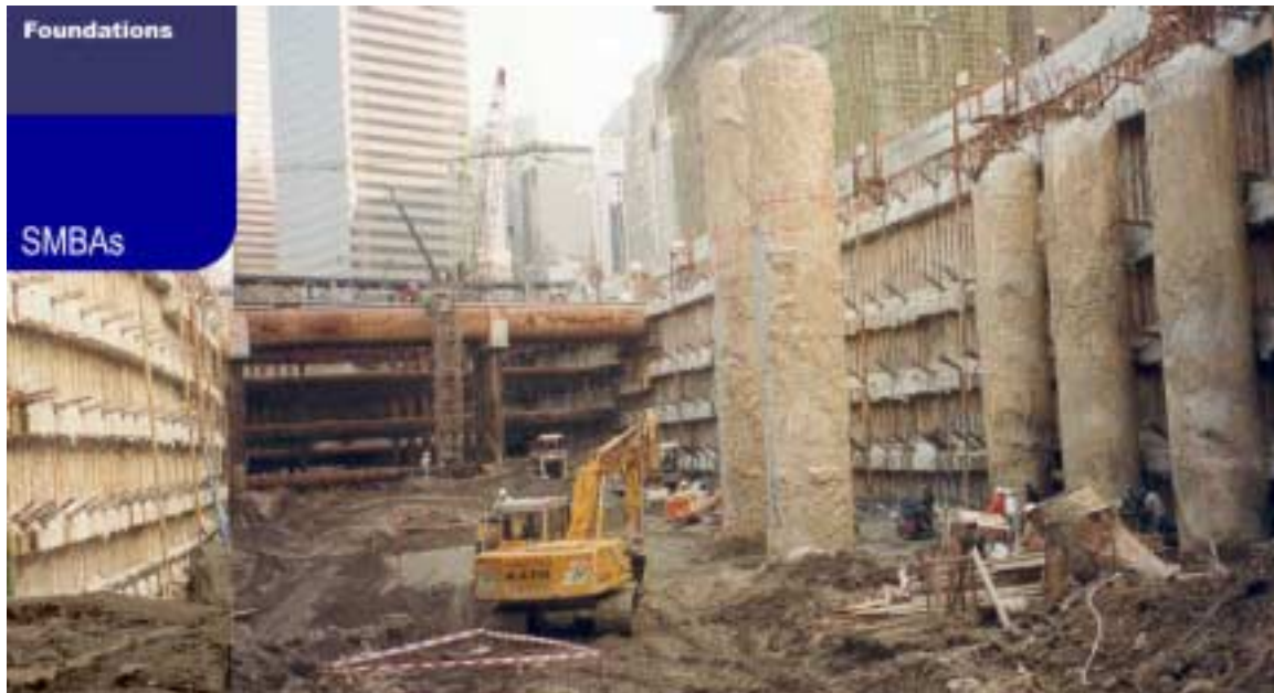
200t working load removable temporary anchors in Hong Kong